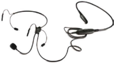
Behind-the-head Lightweight Headset PMLN5392

The benefits and assurance of the ATEX certification will be invalidated by using non-approved accessories. The Motorola ATEX accessories for the MTP850Ex have been fully tested to meet the ATEX standards. These can be used with confidence in gas and dust explosive risk areas.